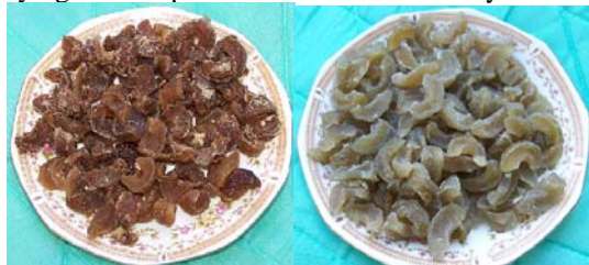
Open Sun Dried. Processed on Solar Dryer

No fossil fuels are required in this case. Boiling of Amla is carried out on solar concentrators, while drying of final product is done on solar dryers.