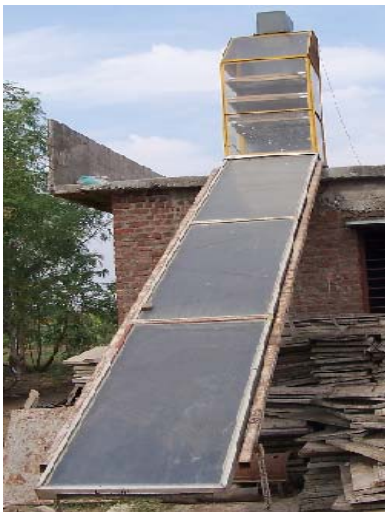
Photograph 4: Low cost solar dryer for agro processing.

3.3 Solar Dryers: Solar dryers are normally designed for use below 55° C, assisted with airflow. Author 1 has designed a simplified low cost version of solar dryer, which is affordable at rural level.