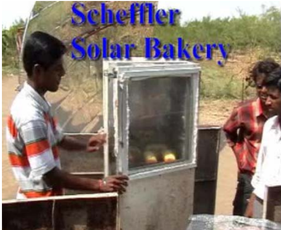
Photograph 3: Oven used for bakery using Scheffler Concentrator.

3.3 Solar Dryers: Solar dryers are normally designed for use below 55° C, assisted with airflow. Author 1 has designed a simplified low cost version of solar dryer, which is affordable at rural level.